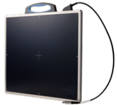
Configuration Detector System Control Unit